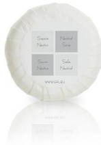
NEUTRA/SAPONE VEGETALE 20GR TONDO PLISSE' CF280