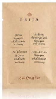
PRIJA/ BUSTINA DOCCIA SHAMPOO GINSENG 10ML CF600