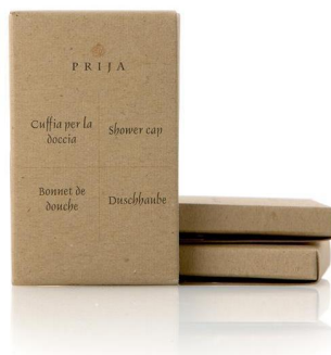
PRIJA/CUFFIA DOCCIA CF100 (CRT10)