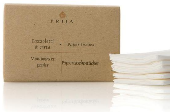
PRIJA/5 FAZZOLETTI CARTA SCATOLA CF100 (CRT3)