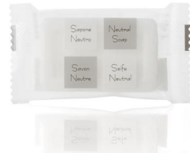
NEUTRA/ SAPONE VEGETALE 12GR RETT. FLOW P. CF500