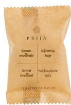
PRIJA/ SAPONETTA ROTONDA FLOW P. 15GR CF300