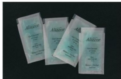
GEL SHAMPOO DOCCIA CF500