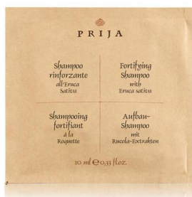
PRIJA/ BUSTINA SHAMPOO ALL'ERUCA SATIVA 10ML CF500