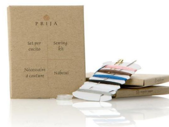
PRIJA/ SET MINICUCITO CF100 (CRT10)