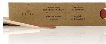
PRIJA/LIMA UNGHIE E BASTONCINO DI CILIEGIO CF200 (CRT5)