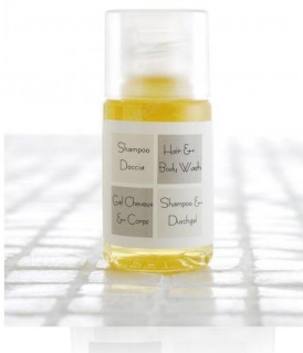
NEUTRA/ FLACONE DOCCIA SHAMPOO 20ML CF50 (CRT8)