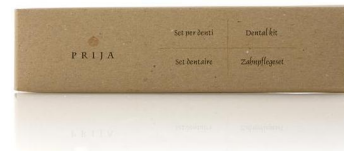
PRIJA/SET DENTI ASTUCCIATO CF100 (CRT5)