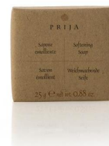
PRIJA/SAPONE VEGETALE BEIGE 25GR CF100 (CRT5)