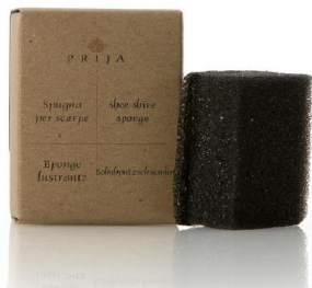
PRIJA/SPUGNA PULIZIA SCARPA CF100 (CRT10)