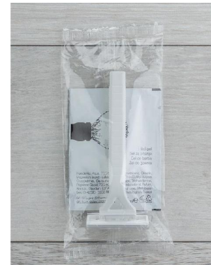
LOGO/SET BARBA CF100 (CRT6)