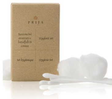
PRIJA/SET 4 COTTON FIOC E 3 BATUFFOLI COTONE CF100 (CRT10)