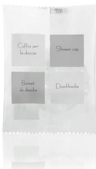
NEUTRA/ CUFFIA DOCCIA FLOW P. CF100 (CRT10)