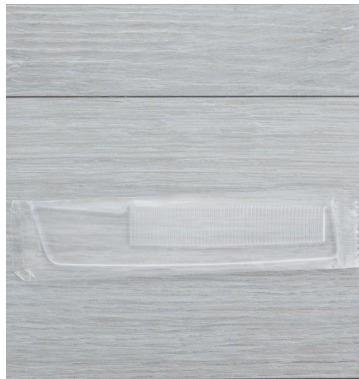
LOGO/PETTINE TRASPARENTE CON MANICO CF100 (CTR10)