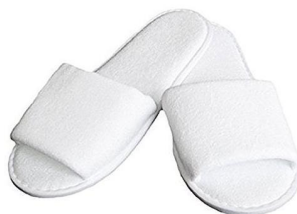
CIABATTA IN SPUGNA APERTA CF50 PAIA