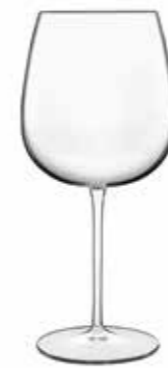
C 503 BAROLO - SHIRAZ 75 CL - 25 1/4 OZ H 23.2 CM - 9 1/8" Ø 10.4 CM - 4 1/8" 12736/01 • BAF6/24