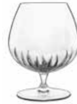
C 416 COGNAC 46.5 CL - 15 3/4 OZ H 12.7 CM - 5" Ø 9.67 CM - 3 3/4"