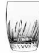
PM 920 INCANTO D.O.F. 34.5 CL - 11 3/4 OZ H 10.9 CM - 4 1/4" Ø 8.1 CM - 3 1/4"