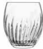
PM 801 COCKTAIL ICE 50 CL - 17 OZ H 10.4 CM - 4" Ø 9.4 CM - 3 3/4"