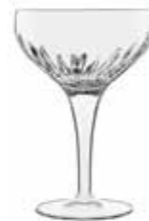
C 40 COCKTAIL 22.5 CL - 7 1/2 OZ H 14 CM - 5 1/2" Ø 9.5 CM - 3 3/4" 12460/01 • BAF6/24 12460/02 • GP4/16