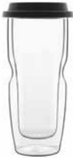
RM 507 COFFEE ON THE GO - LARGE WITH BLACK SILICONE LID 46 CL - 15 1/2 OZ H 19 CM - 7 1/2" Ø 9.2 CM - 3 5/8" 12836/01 • GP1/6