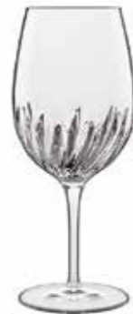
C 352 SPRITZ 57 CL - 20 OZ H 22.5 CM - 8 7/8" Ø 9.1 CM - 3 5/8" 12458/01 • BAF6/24 12458/02 • GP4/24