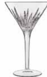
C 211 MARTINI 21.5 CL - 7 1/4 OZ H 17.2 - 6 1/8" Ø 10.4 CM - 4 1/8" 12459/01 • BAF6/24 12459/02 • GP4/16