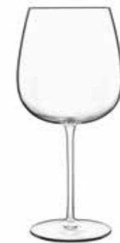
C 504 OAKED CHARDONNAY 65 CL - 22 OZ H 21.8 CM - 8 5/8" Ø 10.1 CM - 4" 12737/01 • BAF6/24