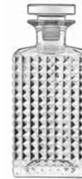
H 10709 ELIXIR DECANTER CON TAPPO IN VETRO ERMETICO ELIXIR DECANTER WITH AIRTIGHT GLASS STOPPER 0.75 L - 25 1/4 OZ 0.78 L - 26 1/4 OZ BRIMFUL H 20.7 CM - 8 1/8" Ø 9 CM - 3 1/2" 12468/01 • CT6 12468/02 • GP1/6