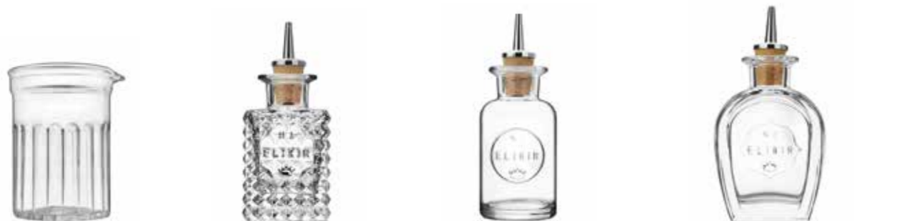
H 10631 MIXING GLASS 70.5 CL - 23 3/4 OZ BRIMFUL H 14.3 CM - 5 5/8" Ø 11.5 CM - 4 1/2" 12221/01 • CT12