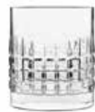
PM 1015 CHARME D.O.F. 38 CL - 12 3/4 OZ H 9.6 CM - 3 3/4" Ø 8.5 CM - 3 3/8" 12328/01 • BAF6/24 12328/02 • GP4/24