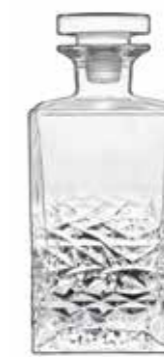
H 10770 TEXTURES DECANTER CON TAPPO IN VETRO ERMETICO TEXTURES DECANTER WITH AIRTIGHT GLASS STOPPER 0.75 L - 25 1/4 OZ 0.78 L - 26 1/4 OZ BRIMFUL H 20.7 CM - 8 1/8" Ø 9 CM - 3 1/2" 12520/01 • CT6 12520/02 • GP1/6