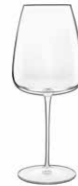
C 496 CABERNET - MERLOT 70 CL - 23 3/4 OZ H 24.3 CM - 9 5/8" Ø 10.1 CM - 4" 12731/01 • BAF6/24