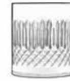
PM 1056 DIAMANTE D.O.F. 38 CL - 12 3/4 OZ H 9.6 CM - 3 3/4" Ø 8.4 CM - 3 1/4"