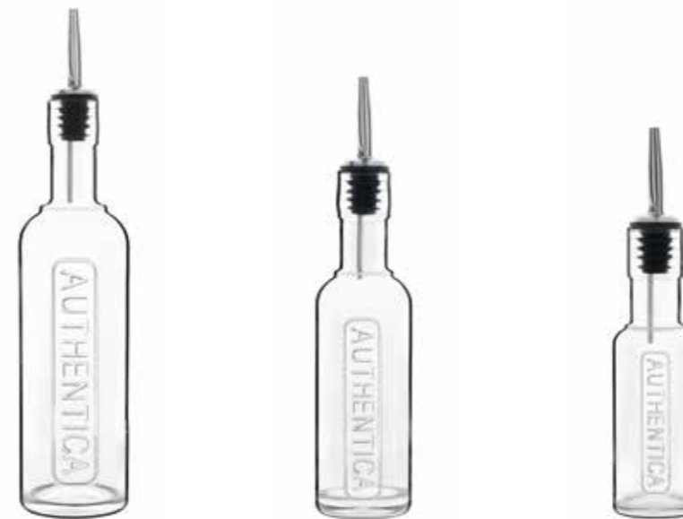
H 10585 BOTTIGLIA AUTHENTICA CON VERSATORE SILICONE/ ACCIAIO INOX (18/8) 0.50 L AUTHENTICA BOTTLE WITH SILICONE/STAINLESS STEEL (18/8) POURER 17 OZ 52.5 CL - 17 3/4 OZ BRIMFUL H 31.3 CM - 12 3/8" Ø 6.9 CM - 2 3/4" 12207/02 • CT12 12207/03 • CT6