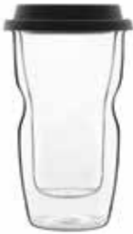
RM 508 COFFEE ON THE GO - SMALL WITH BLACK SILICONE LID 34 CL - 11 1/2 OZ H 15 CM - 5 7/8" Ø 9.2 CM - 3 5/8" 12837/01 • GP1/6