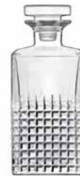
H 10769 CHARME DECANTER CON TAPPO IN VETRO ERMETICO CHARME DECANTER WITH AIRTIGHT GLASS STOPPER 0.75 L - 25 1/4 OZ 0.78 L - 26 1/4 OZ BRIMFUL H 20.7 CM - 8 1/8" Ø 9 CM - 3 1/2" 12521/01 • CT6 12521/02 • GP1/6