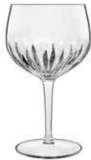
C 493 SPANISH GIN & TONIC 80 CL - 27 OZ H 20.5 CM - 8 1/8" Ø 11.9 CM - 4 5/8" 12464/01 • BAF6/12 12464/02 • GP4/8