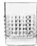
PM 1016 ELIXIR D.O.F. 38 CL - 12 3/4 OZ H 9.6 CM - 3 3/4" Ø 8 CM - 3 1/8" 12344/01 • BAF6/24 12344/02 • GP4/24