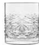
PM 1017 TEXTURES D.O.F. 38 CL - 12 3/4 OZ H 9.6 CM - 3 3/4" Ø 8.6 CM - 3 3/8" 12346/01 • BAF6/24 12346/02 • GP4/24